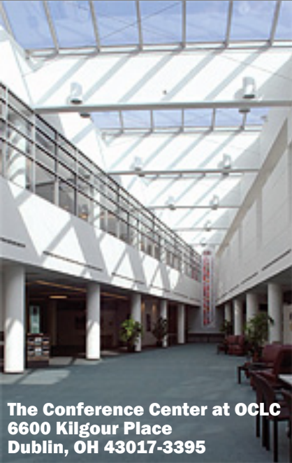
The Conference Center at OCLC 6600 Kilgour Place Dublin, OH 43017-3395